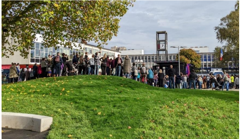
Images: people enjoying Event Island Stevenage