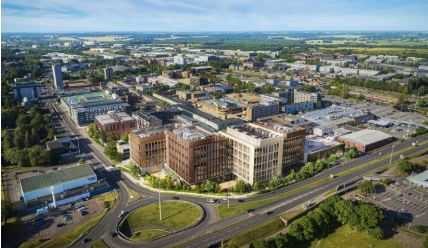
Image: Artist's impression of The Assembly, Phase 2. Credit: Reef Group

The development bolsters the ongoing revitalisation of Stevenage town centre, with restaurant, retail and collaboration spaces at the ground floor level fronting onto a new public square. The introduction of commercial life science space will support existing and future business in the town, bringing footfall and expenditure through the addition of an estimated 1,850 high-value jobs.