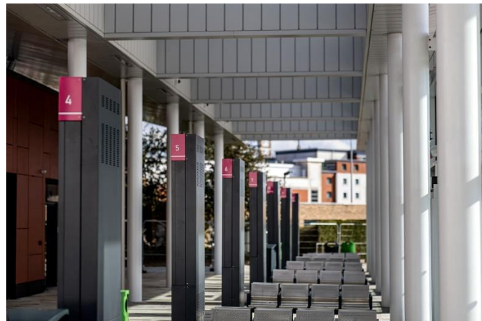
Images: The Stevenage Bus Interchange