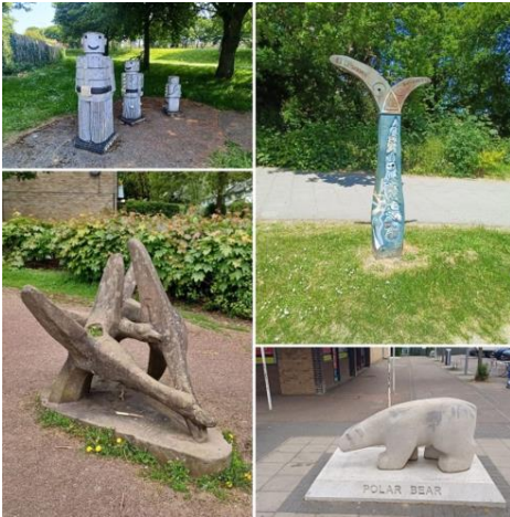
Image: artworks around the town

Work within this area also looks at identifying public realm improvements on key routes in and around the town centre.