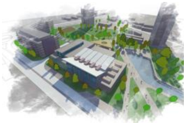
Image: an artist's impression of the new centre

The design of the new Sports & Leisure Centre is in its very early stages and the council is working with the local community on a facility that will provide something for everyone. This co-production commenced in November when the council asked residents, businesses and visitors to complete a short survey to help us understand what is important to them.