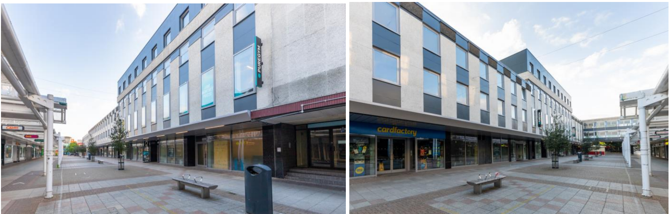
Images: improvements to Queensway North

Like our other schemes, Queensway North is based on 'mixed-use' principles and is designed to increase the number of people living and working in Stevenage Town Centre, thereby adding to the demand for services and businesses based here. A number of new commercial tenants have already invested in the premises including PureGym.