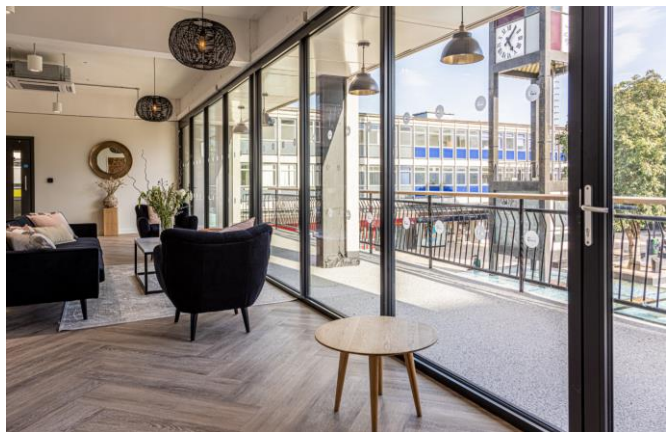
Image: North Block and the interior of Co-Space