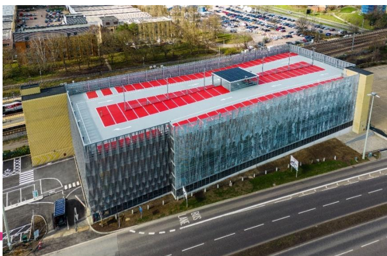
Images: Railway North car park.