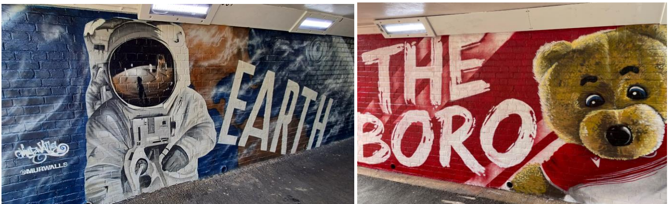
Images: STEM and Stevenage FC themed murals

The project has been funded by the Stevenage Development Board through the Towns Fund. Part of the funding is allocated to improving cycling and pedestrian connectivity, and artworks to the underpasses and cycleways throughout the town are a key part of this, creating some stunning visuals in areas close to key parts of Stevenage. Stevenage Borough Council and Hertfordshire County Council (as Highways Authority) have worked in partnership to improve the underpasses, creating a colourful, welcoming pathway to key areas within the town.